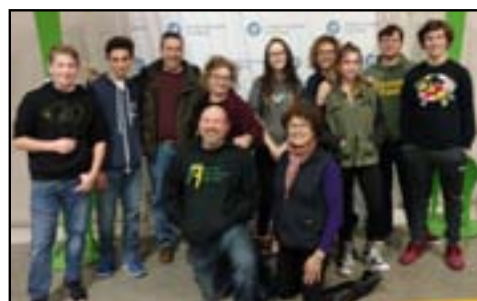
Hagiga volunteers at the Food Bank