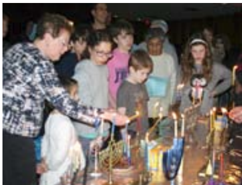
Hanukkah Photo Gallery, pages 4 & 5